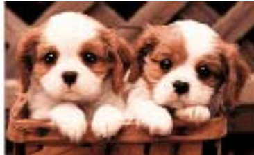
Wish we'd been invited.

As of this month our membership has grown to 341 and we are expecting it to grow even more. Member support makes all the difference – the Players couldn't operate without you. If you haven't had the opportunity to look at the upcoming season schedule you will be pleasantly surprised. The 2008-2009 season is the best ever. Bring a friend and enjoy the excitement on stage!